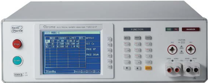
19032 Electrical Safety Analyzer

A more acceptable technique is to perform the non-destructive insulation resistance test before and after the Hipot test. Comparing the variations before and after provides more control of product performance over the long run.