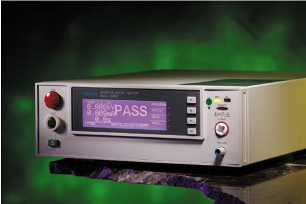
19052 AC/DC/IR Hipot Tester